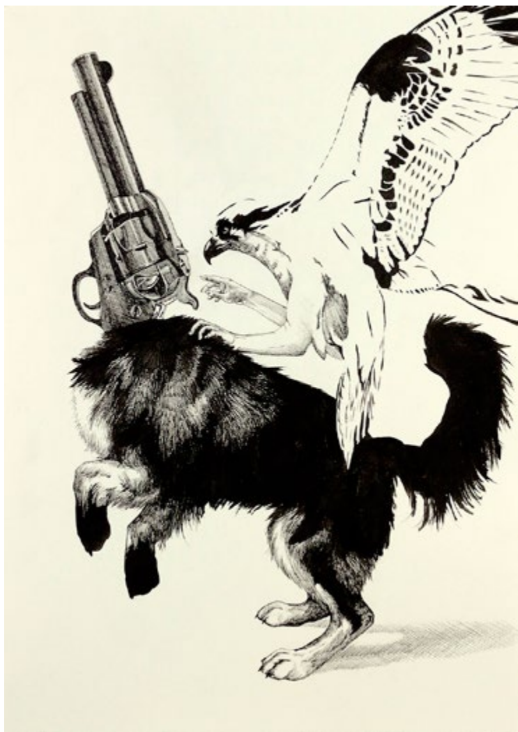
Trigger Finger , ink on paper, 21 x 15 inches