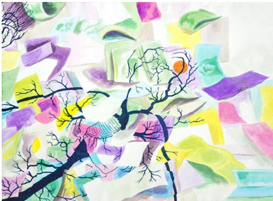
A Circulatory System , ink and watercolor on paper, 10 x 14 inches