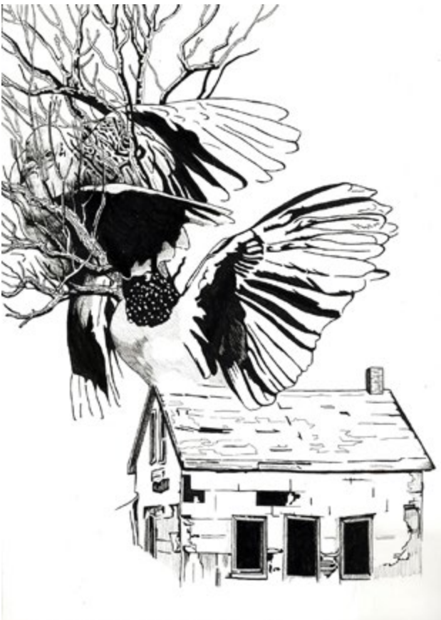
Stick , ink on paper, 14 x 10 inches