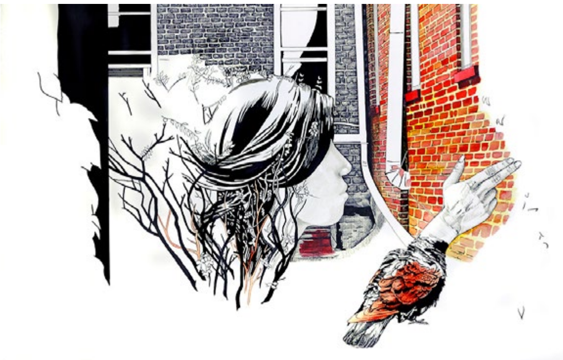
For Your Charming Lack of Content , ink and watercolor on paper, 21 x 33 inches