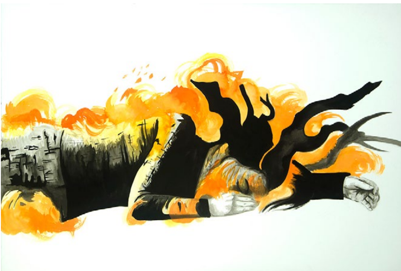
The Light Within Us We Do Not Use , ink and watercolor on paper, 23 x 23 inches