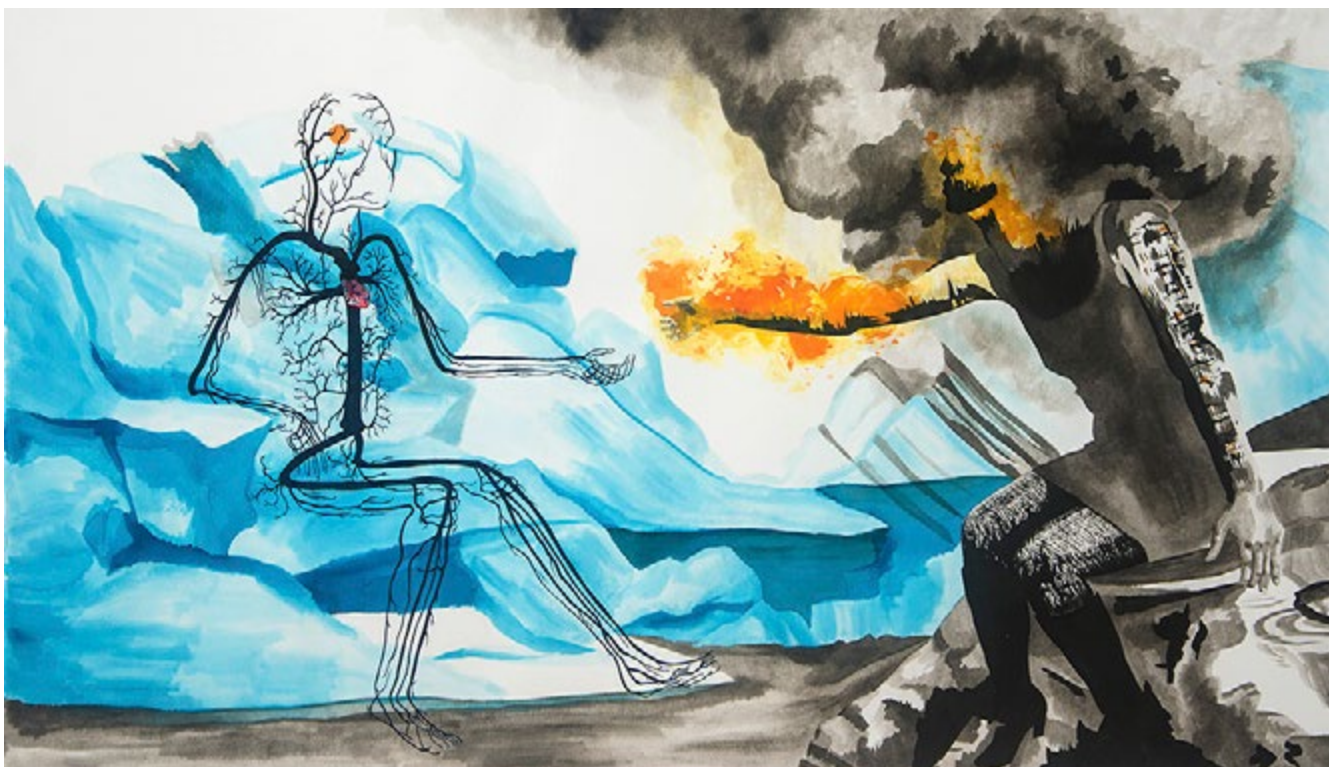
Counter Intuition , ink and watercolor on paper, 20 x 30 inches