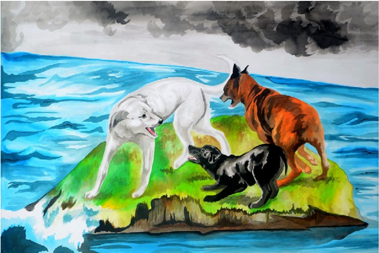
Our Little Freedom , ink and watercolor on paper, 20 x 30 inches